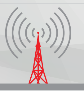
Telecom and Optical Fibre Network